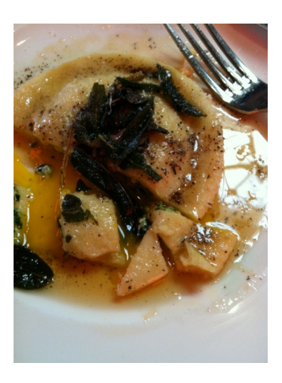
Spinach and ricotta raviolo. Farm fresh egg. Fried sage. Brown butter. \underline{\text{@ Bottega}}