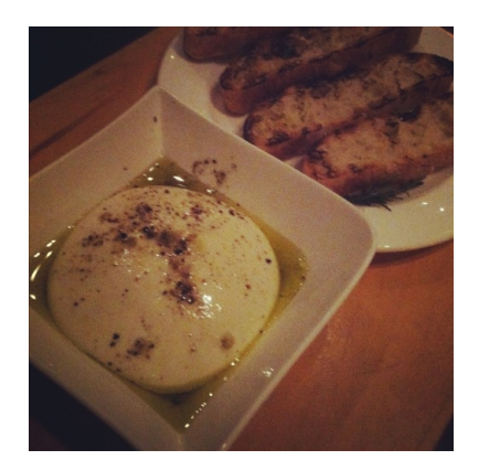
Mozzarella (Hand stretched and made to order) @ Tra Vigne