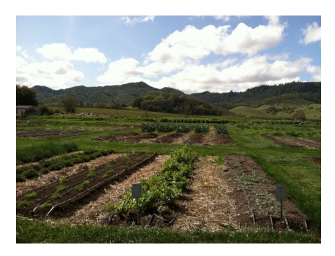
Herb garden @ French Laundry

So great food, great wine, what more could you ask for you say? How about a beautiful landscape? Oh yea, got that covered too.