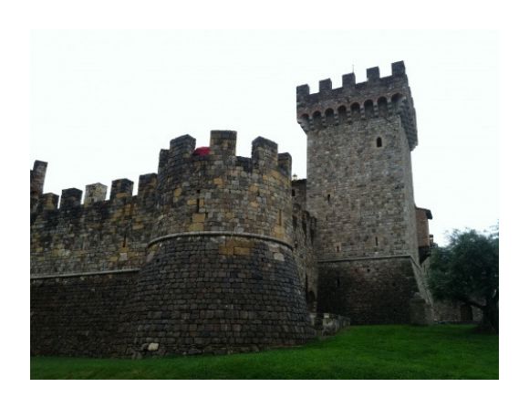
Castello di Amoroso

We visited some really cool wineries including the more touristy spots: